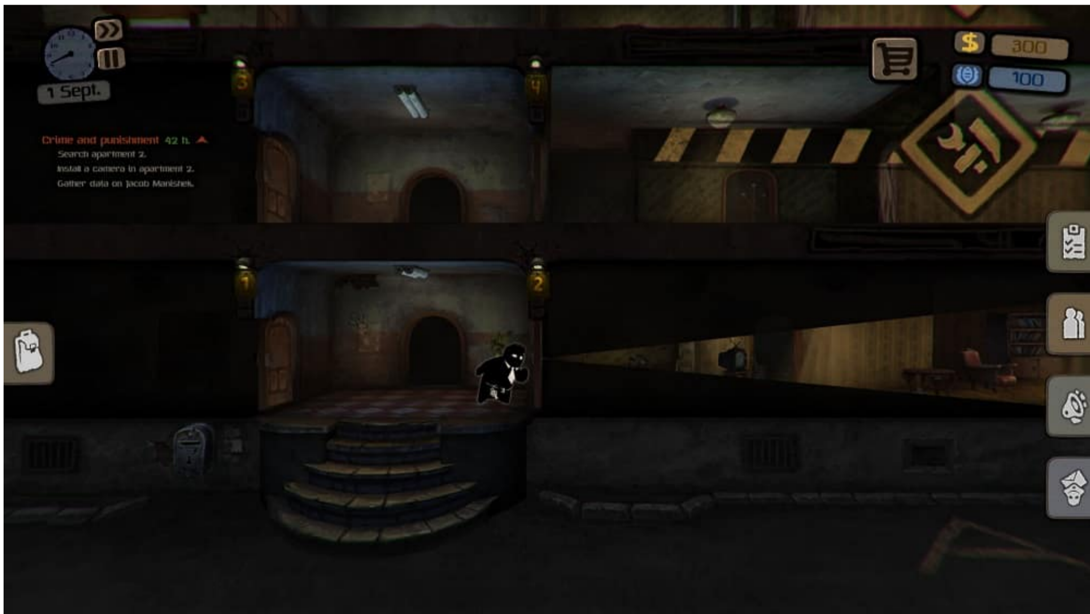
Beholder - Blissful Sleep Crack